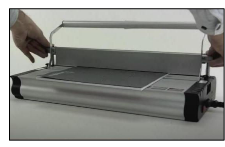
6) Set the pressure bar directly on the strip and make sure it locks firmly in place. Notice the hot knife lever's position should be exactly where it is for steps 1-6.