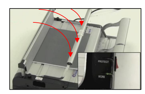
7) Carefully set the hot knife lever down and wait a few seconds until the Protect Indicator illuminates. <a href="MPORTANT!!!">IMPORTANT!!!</a> NEVER forcefully push the hot knife lever down as it may cause serious damage to the hot knife strip. Gently set it down and allow it to move along with the machine's cutting action.