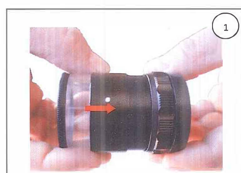
very gently turn the ferrule of the upper lens up to its full extension, without forcing when it is next to the limit.