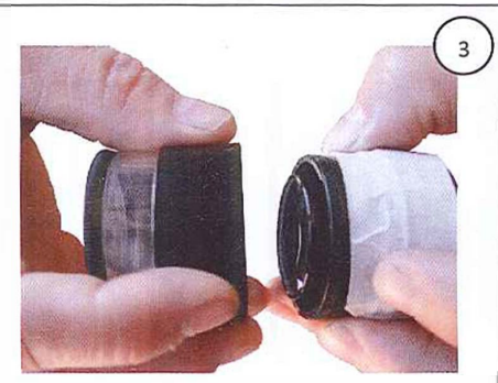
Unscrew the lower part, overcoming the initial resistance