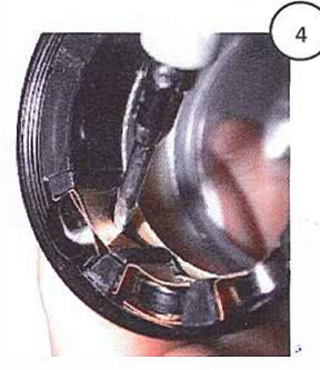
With a small screwdriver remove the batteries on the lower part, then replace them, re-close the unit and remove the scotch tape.